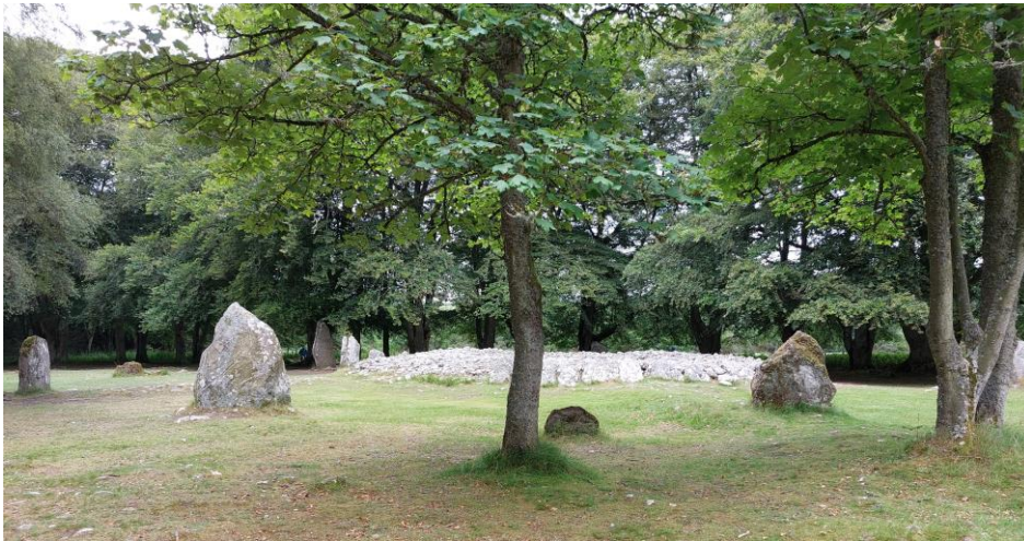
One of the Chambered Cairns at Balnuaran of Clava