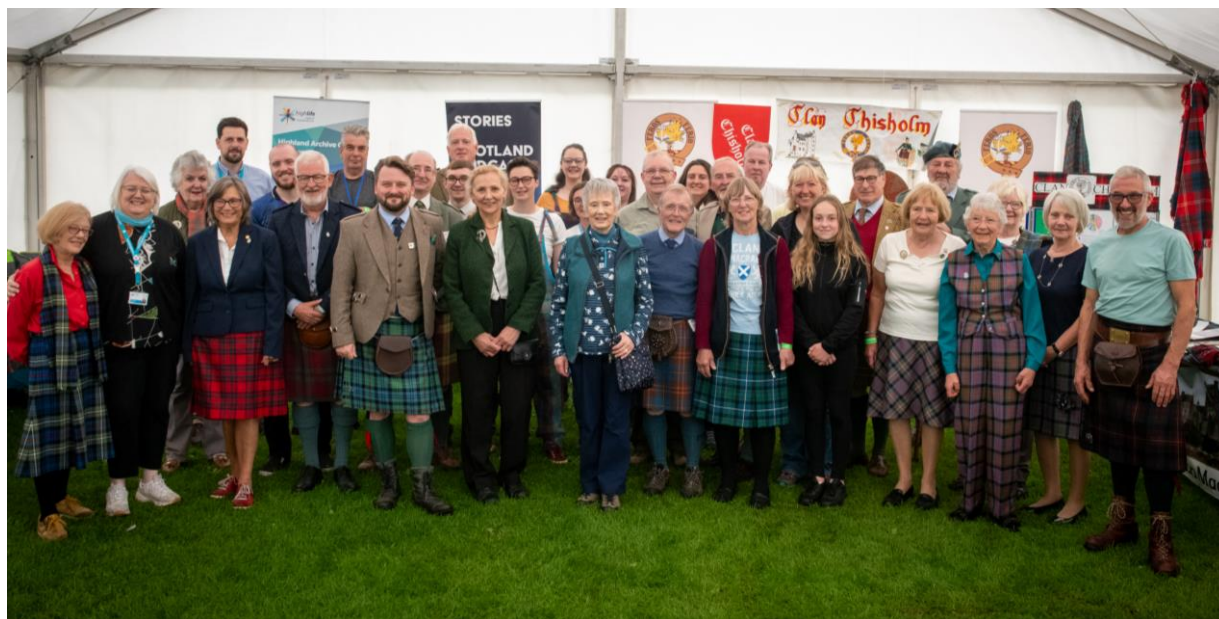
The Clans and Associations line up ahead of the Games opening

The weather that day was rather wet with scattered showers and a couple of torrential downpours with thunder in the afternoon. When these deluges occurred, our marquee became packed with visitors sheltering from the rain.