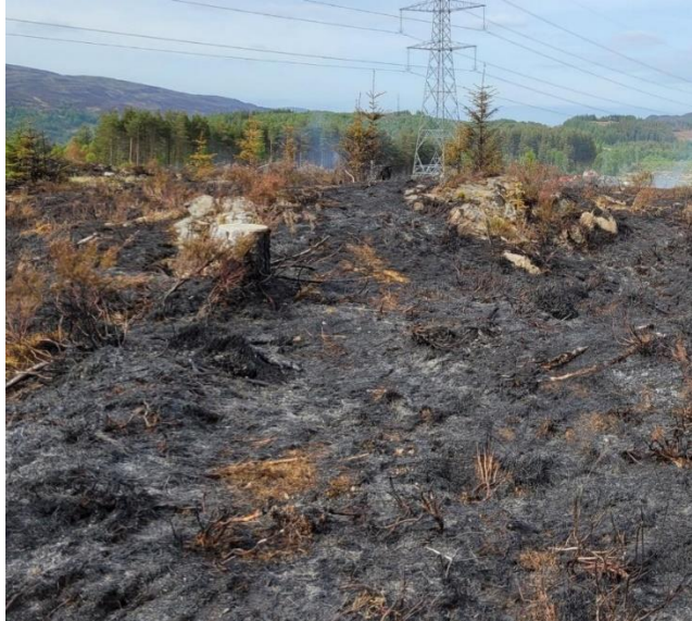
Images taken by the fire services