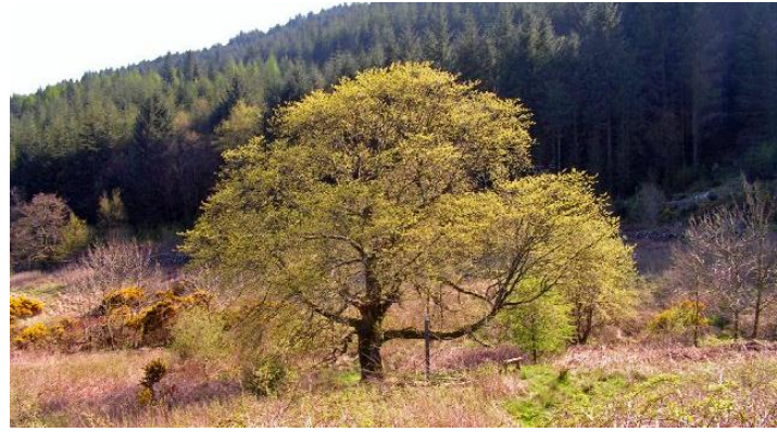
Wych Elm near Castle Douglas, Galloway

Wych elm is highly susceptible to Dutch elm disease, a fungal disease which has devastated populations of elms since it arrived in the UK in the 1960s.