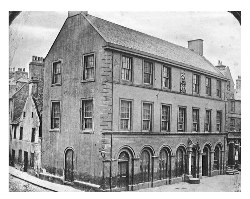
The Old Inverness Town House

Before the Victorian Town House was built in 1882 a three storey building had sat on the site. It was originally the town house of Lord Lovat used for business and social purposes by the clan chief and built beside the Exchange the burgh's meeting point. During the late 1600's the Lovat Fraser finances were in a poor state and in 1709 the Lovat residence was sold to the council to help ease debts. It would be seven years before the building was used. Gradually it was expanded into a three-storey building. The top floor was given over to use by the Trades Guilds after they significantly donated to the cost. An arcade of seven arches fronted the ground floor which housed a public reading room. The council chamber itself and the Provost's room were on the first floor.