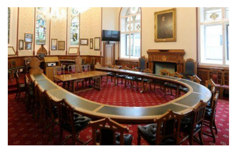
The Cabinet Room