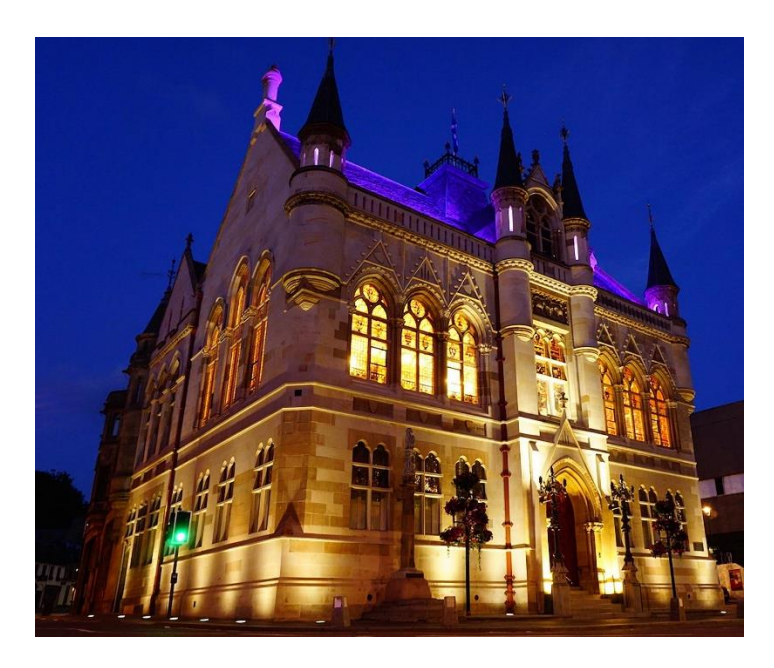
The 1882 Town House

Sculptures of two dogs which were part of the original building have been discovered after 50 years and reinstated.