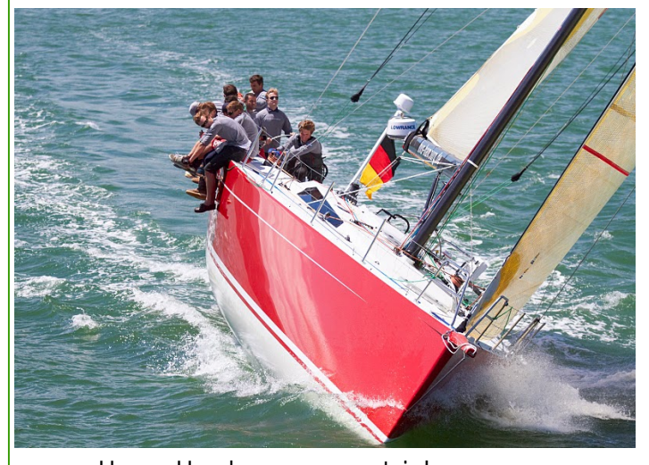
Haspa Hamburg, on sea trials