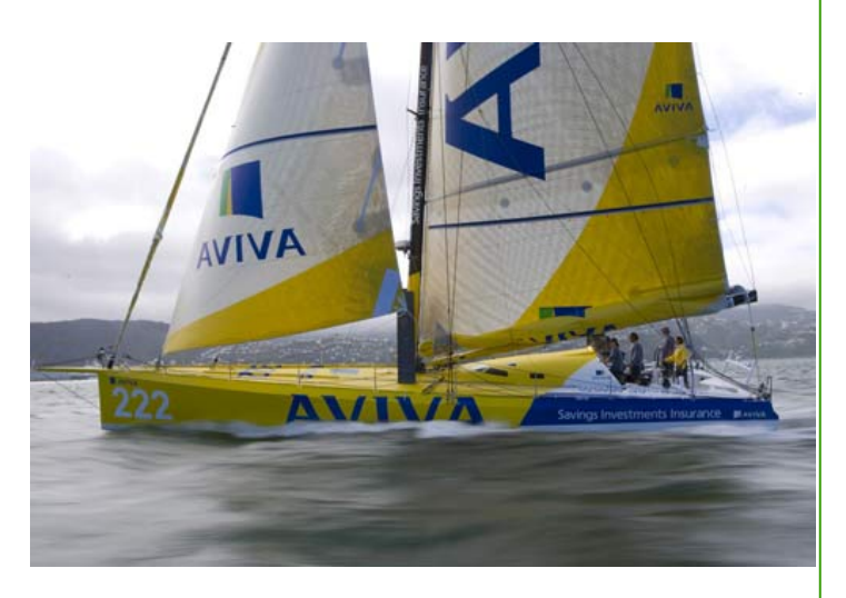
Aviva, Dee Caffari's boat, on sea trials in Wellington