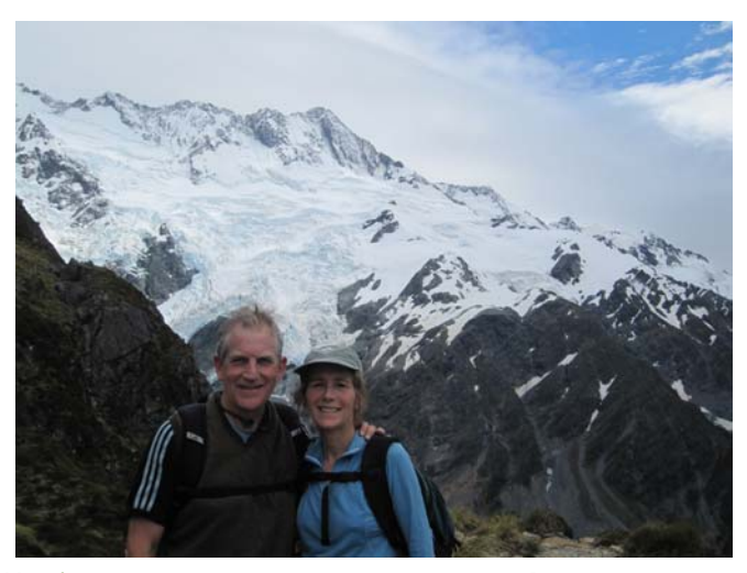
Newsletter # 48 March 2010