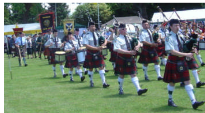
The pipes and drums lead the clans at the opening of the games

(www.robertburns.org/works) This is a great website, and has modern translations of some of the more obscure words. For those wishing to produce,