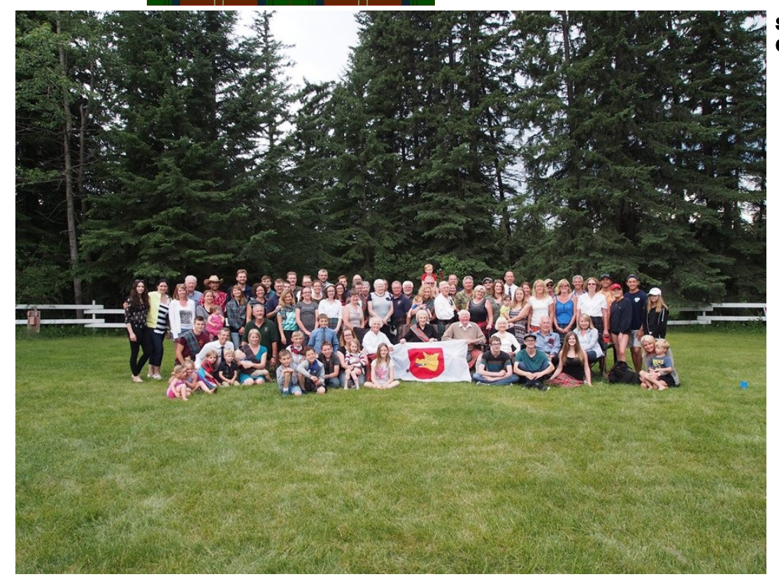
Summer 2016 Calgary Clan Chisholm Gathering