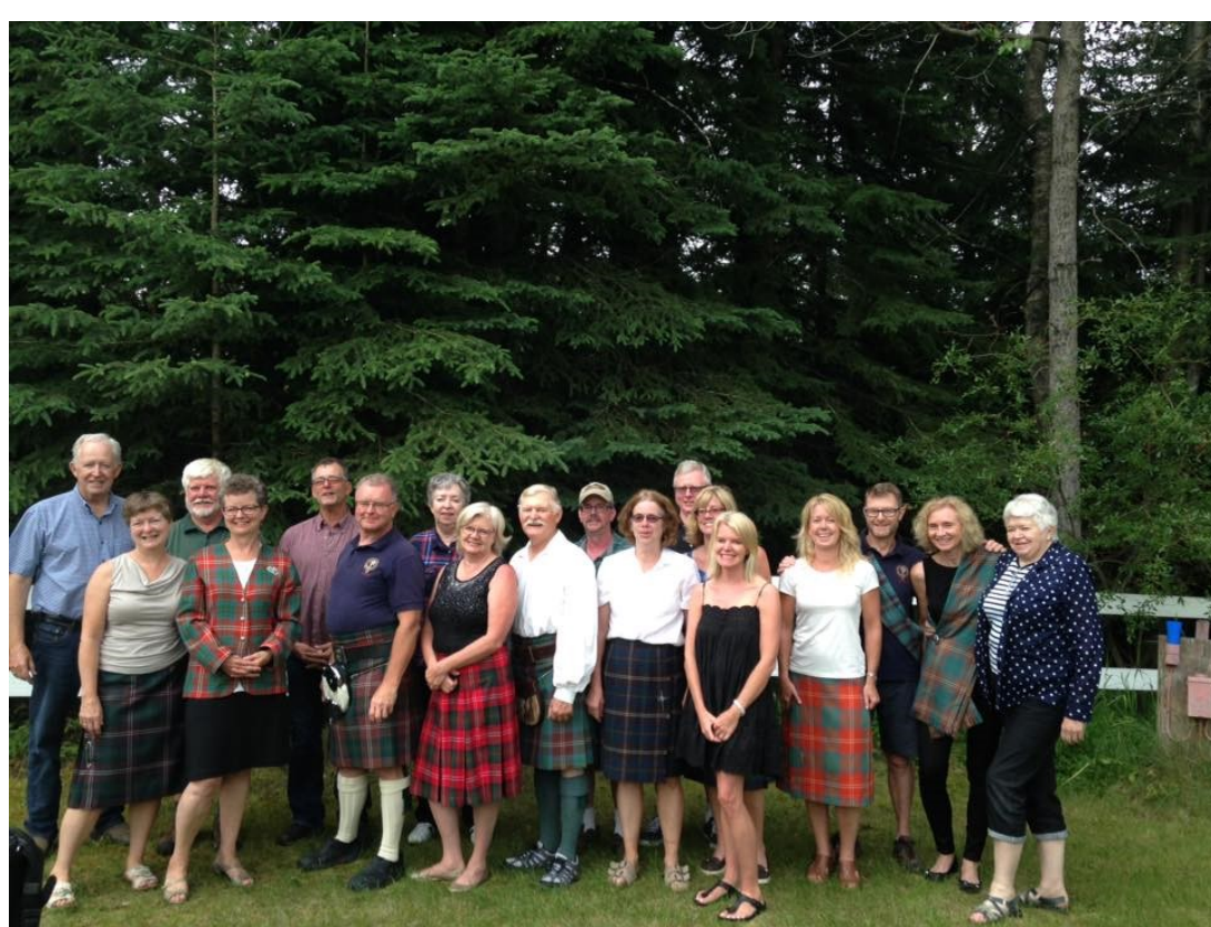
18 of 22 Chisholm First Cousins