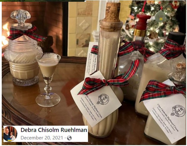
Christmas with Clan Chisholm Highland Cream