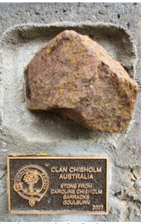
Celtic Family Wall

As well as offering a Clan tent, participation can also include carrying the Clan Banner in the Friday morning Opening Ceremony March and Calling of the Clans, marching behind their flag/banner bearer in the Saturday Street Parade, as well as in in the pipe band-processed parade and recognition ceremonies carried out in the Scottish Ceremony on Sunday morning. This concludes with a moving prayer and the Kirkin' o' the Tartan. There are plenty of opportunities to participate in events if desired.