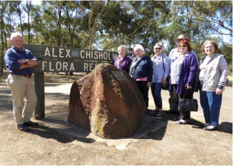
Our group visited the Alec Chisholm Flora Reserve in Maryborough

Ballarat's famed Botanic Gardens and the Begonia festival. The gardens are brilliant. Flower beds out in full bloom; lamb's tongue borders with beds of begonia, salvia, dahlias, delphinium etc. in a dazzling display of colour amongst the tall trees from everywhere around the world and the lush grassy parkland.