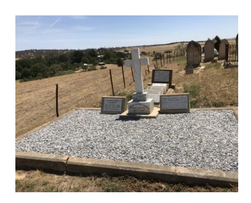
Left - Figure 1 Right – Figure 2