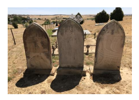
Top left – Figure 3 Top right – Figure 4 Centre left – Figure 5 Below – Figure 6 (transcription only)