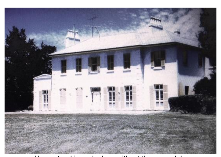
Homestead in early days without the verandah.