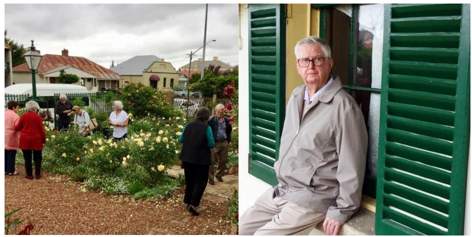
St Clair's rose garden.

Later in the morning to St Clair – a lovely local museum covering Goulburn history and beyond.