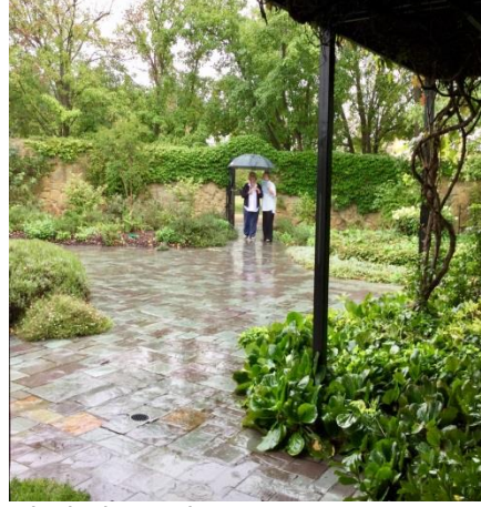
Afternoon tea and a wander in the gardens

In both homesteads we were allowed to make our own inspections. What stood out in both properties was how well they were maintained. One was the more traditional, the other more contemporary. After a full day of sightseeing we had dinner at the Post House Motel where the majority of the party were staying. 'Phew!' would be a good word to describe the day's activities, it was full.