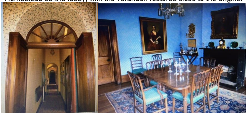
The hallway and the dining room as restored

Homestead as it is today, with the verandah restored close to the original