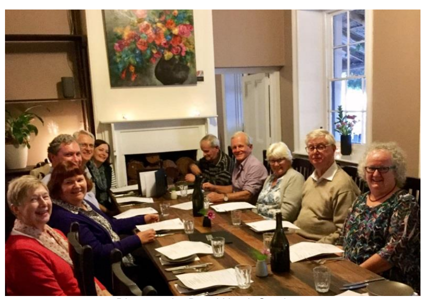
Dinner at the Royal Hotel, Gundaroo

Sunday was dispersal day with the trip to the Rocky Hill War Memorial and luncheon at the Paragon cancelled.