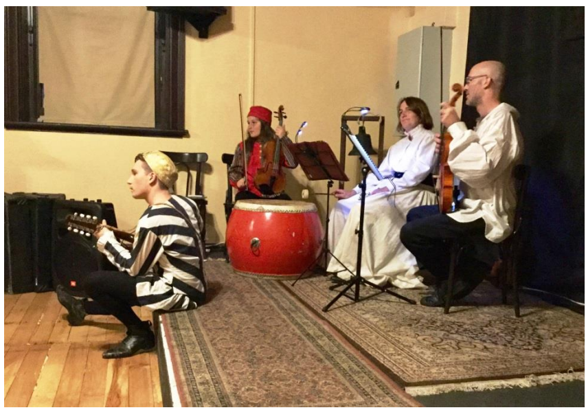
'Twelfth Night' with the Leider Theatre Company at The Goulburn Club

Night. This was enjoyed by all as it was held inside and we felt that we were part of the cast. The acting was of a high order.