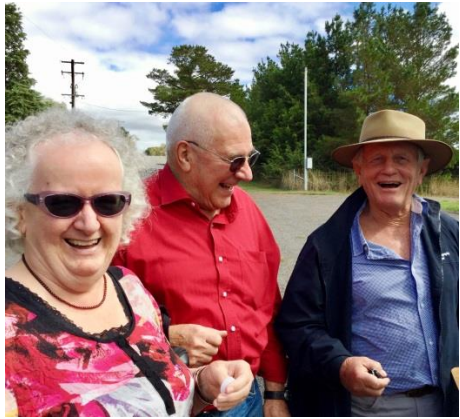
AGM at Chisholm Park