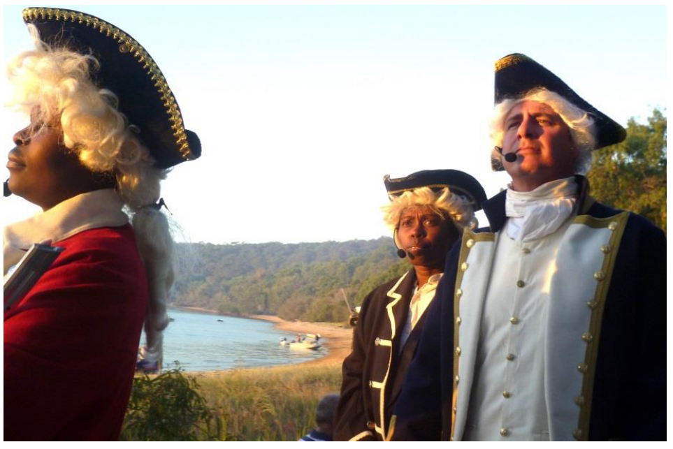
Copyright Clan Chisholm Society Australia Incorporated, Newsletter 2016.2