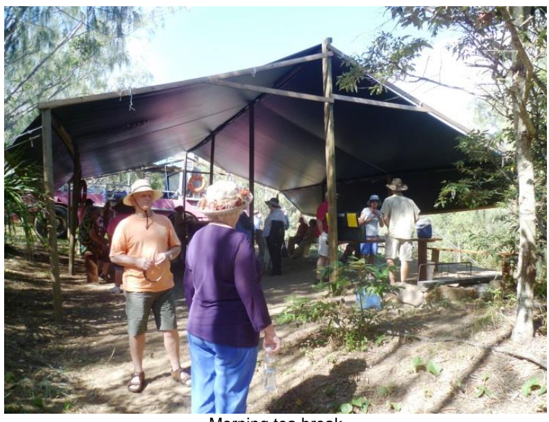
Morning tea break