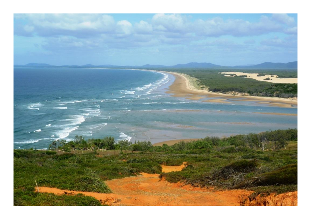
The view was amazing as we looked right back around the bays to Agnes Water in the distance.