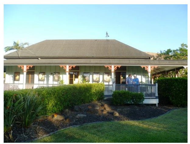
The original home at the Rum Factory