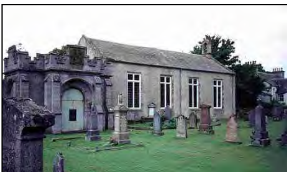
The Clan Grant Centre is in the old church at Duthil near Carrbridge, a few miles west of Grantown-on-Spey

Account from the Clan Grant Society Website