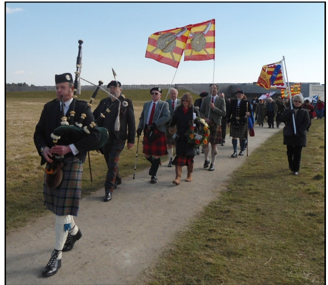
The Camerons lead the way at the annual Culloden Commemoration in April 2013