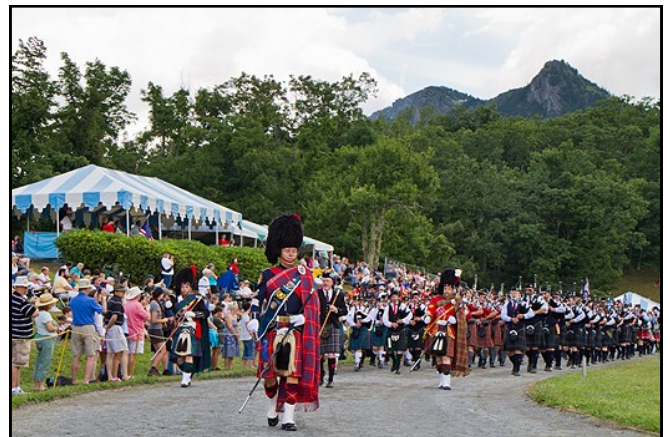
The Grandfather Mountain Highland Games which are held near Banner Elk, the site for the projected SCFC

7 July: Scottish North American Leadership Conference International, to be held at the University of Edinburgh in Scotland.