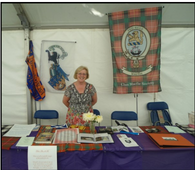
Above: Clan Macfie

The sun shone from a cloudless sky on the large tent (above left) hosted by the AHCS where 12 clans and the HFHS had two tables each and lots of space to set up their displays. There were a steady stream of visitors throughout the day, and all concerned expressed themselves delighted with the facilities so generously provided by the Games Committee.