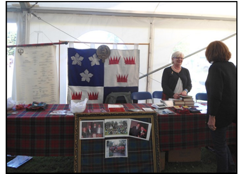
Above: The Frasers of Lovat