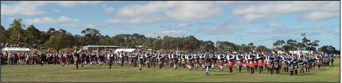
The massed bands at the Geelong Highland Games 2014 in Victoria, Australia

Not a definitive list - corrections & additions welcomed