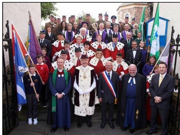
The Kirking of the Council 2013

Highland Council hope to have a Highland Meeting Weekend with games each year to coincide with the Kirking of the Council - and propose that the chief or head of each clan in AHCS takes it in turn to be the event's Patron. This coincides with the idea that we should have an annual AHCS dinner or lunch in aid of charity when we have our AGM, with a different member clan each year providing the guest speaker and nominating the charity it is to be in aid of. Since we have the use of the Town House during the day on the Saturday of this weekend, we might aim to have our AGM and such a lunch there this year.