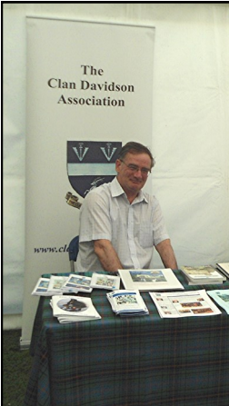
Above: Clan Davidson