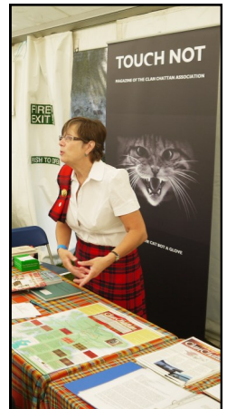
Above: Clan Chattan