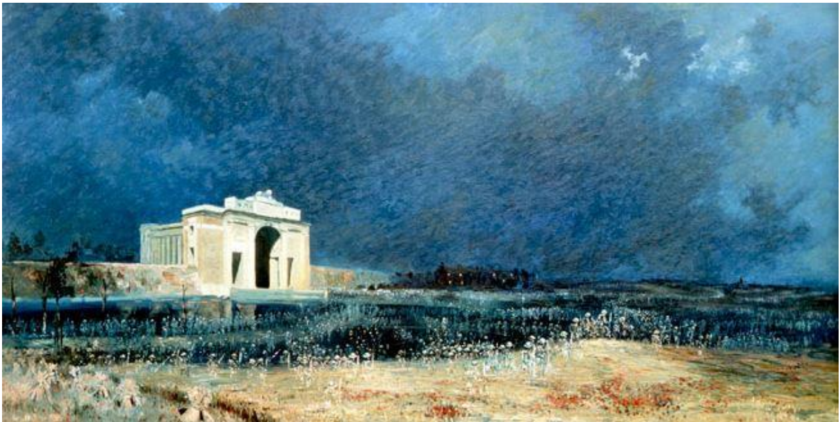
Menin Gate at Midnight by Will Longstaff 1927 AWM Canberra